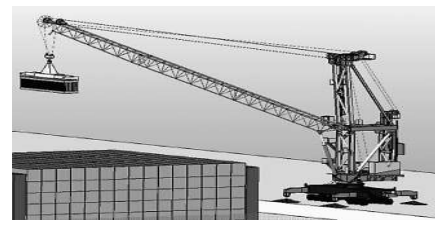
Mobile harbour crane